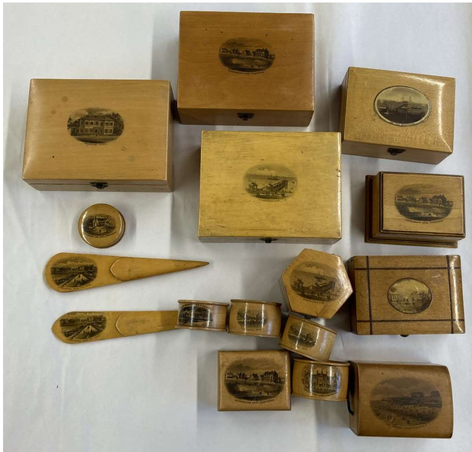
The Hunstanton Heritage Centre Mauchline Ware Collection

The heritage centre collection features local scenes, mainly hand-drawn, featuring the Sandringham Hotel, the Golden Lion Hotel, Hunstanton Pier and views from the Pier, the Convalescent Home, the beach, and Heacham Hall.